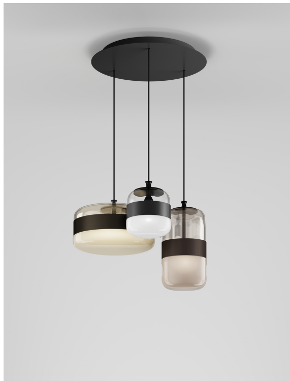
FUTUR SP 3 MC1 NE E27 CE